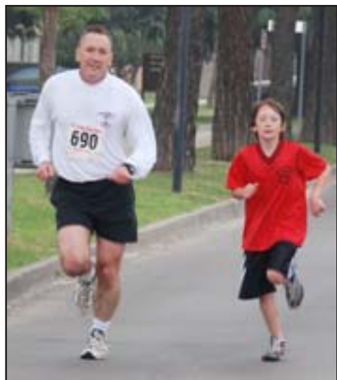
(Top) More than 100 families and groups participate in the Armed Forces Day 5 km Fun Walk/Run under a cloudy, rainy sky Saturday.