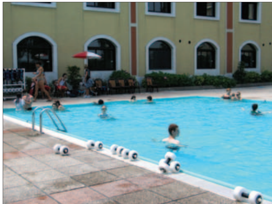
The pool at the Ederle Inn (left) on Caserma Ederle is often used for water aerobics and other classes. The pool opens Saturday for weekends only until the post schools close for the summer.

For details on adult swim lessons and water aerobics call the DFMWR Sport and Fitness office at 634-7009, 0444-71-7009 from off post.