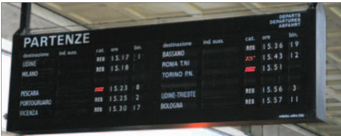
Signs like this partenze (departures) are located by the tracks and in the train stations. They tell what city the train is going to, what type of train it is, when it's due at the station and what track it is arriving on. Under Ind.suss. it also tells you if the train is late ( retardo ) and how long it is delayed.

When you decide to return to Vicenza, just walk or take a water bus to the train station. Trains run to Vicenza every hour during the day, but after about 10:30 p.m. the trains stop running until morning. On Sundays and holidays the trains do not run as frequently.