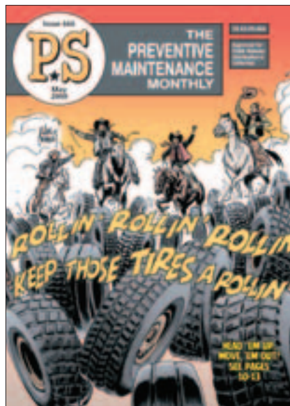
The cartoon-style of P.S magazine makes it attractive to its young audience. The illustrations are by former DC comics artist, Joe Kubert.

To view the latest issue of P.S magazine, visit: https://www.logsa.army.mil/psmag/pshome.cfm