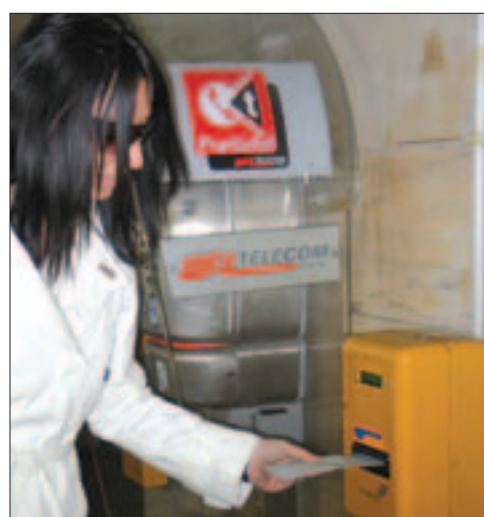
This woman is validating her train ticket by stamping it in one of the many yellow validation machines in the train station. It is mandatory to validate your train ticket.

◆ You can get your train ticket in advance online at: www.trenitalia.com/en/index.html .