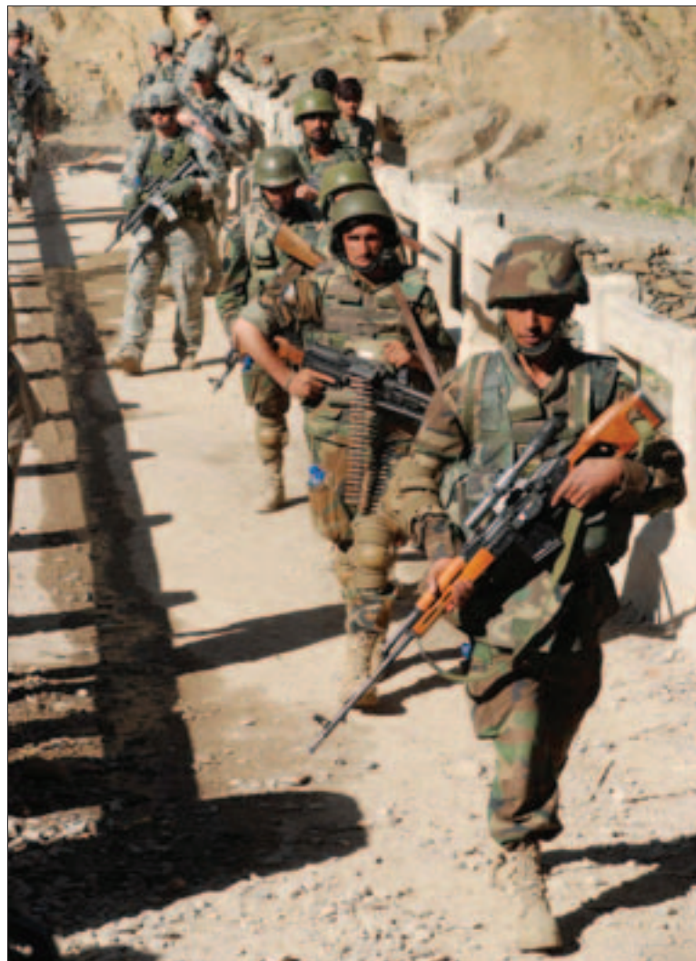
Afghan National Army Soldiers and paratroopers from Headquarters and Headquarters Troop, 1st Squadron, 91st Cavalry (Airborne), walk across the Gowerdesh bridge during Operation Mountain Highway II in Nuristan Province Afghanistan April 27. The ANA, Afghan Border Patrol, U.S. Army and Marines worked together during the operation to rebuild an ABP check point at the bridge, which was partially destroyed by insurgents last summer.

posts Mace, Hatchet and Brick, which enabled the ABP and ANA to drive up from the south and seize the Gowerdesh bridge April 26.